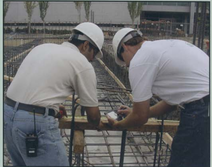
Webcor Technologies is pushing forward to get more mission-critical information delivery and collection capabilities available through Palm handheld devices.

Webcor Technologies' Mission is ~ to design, improve install and support technology solutions for the coordination and decision-making efforts at the core of the building delivery process as well as other professional industries. They achieve it by enhancing the speed and quality of communications, connecting more of their partners, and getting critical information out to where it's needed the most, on the job. ■